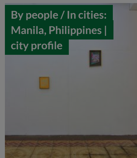
POSTED ON 25 NOV 2015